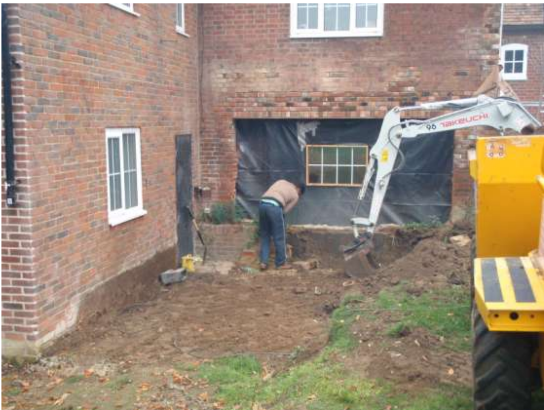
Plate 3. View of ground reduction (looking E)