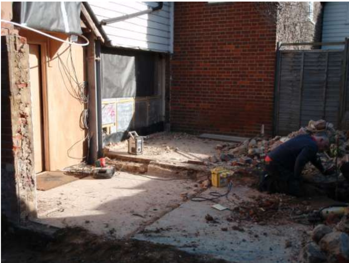
Plate 8. View of cleared adjacent rooms