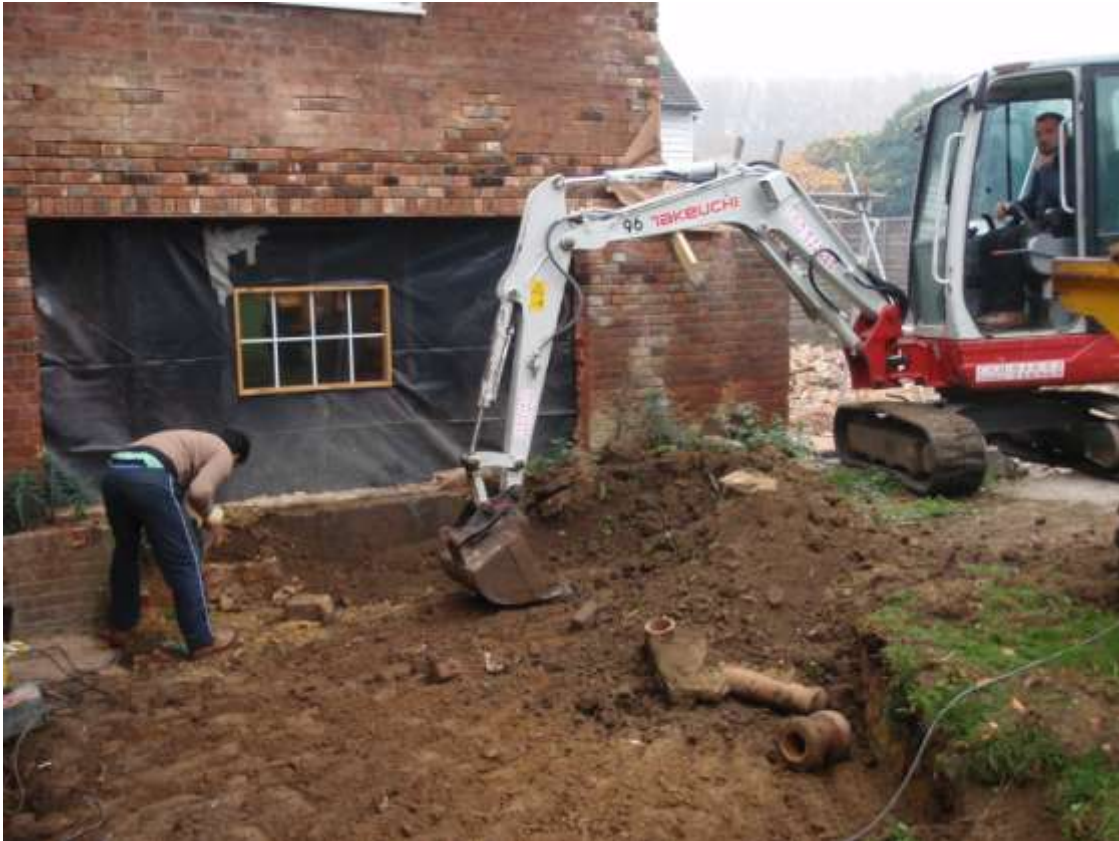
Plate 2. General view of site (looking E)