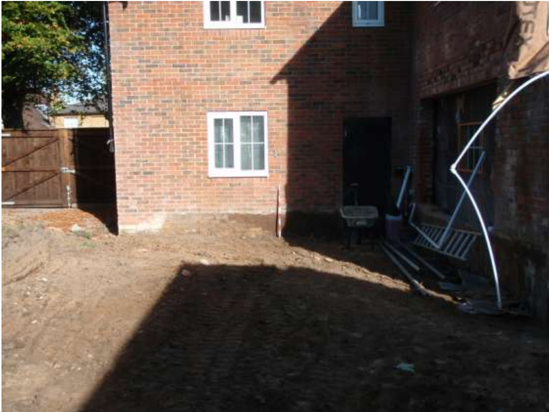
Plate 7. Completed ground reduction (looking north)