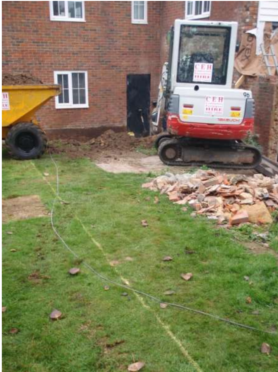
Plate 4. View of extent of site (looking N)