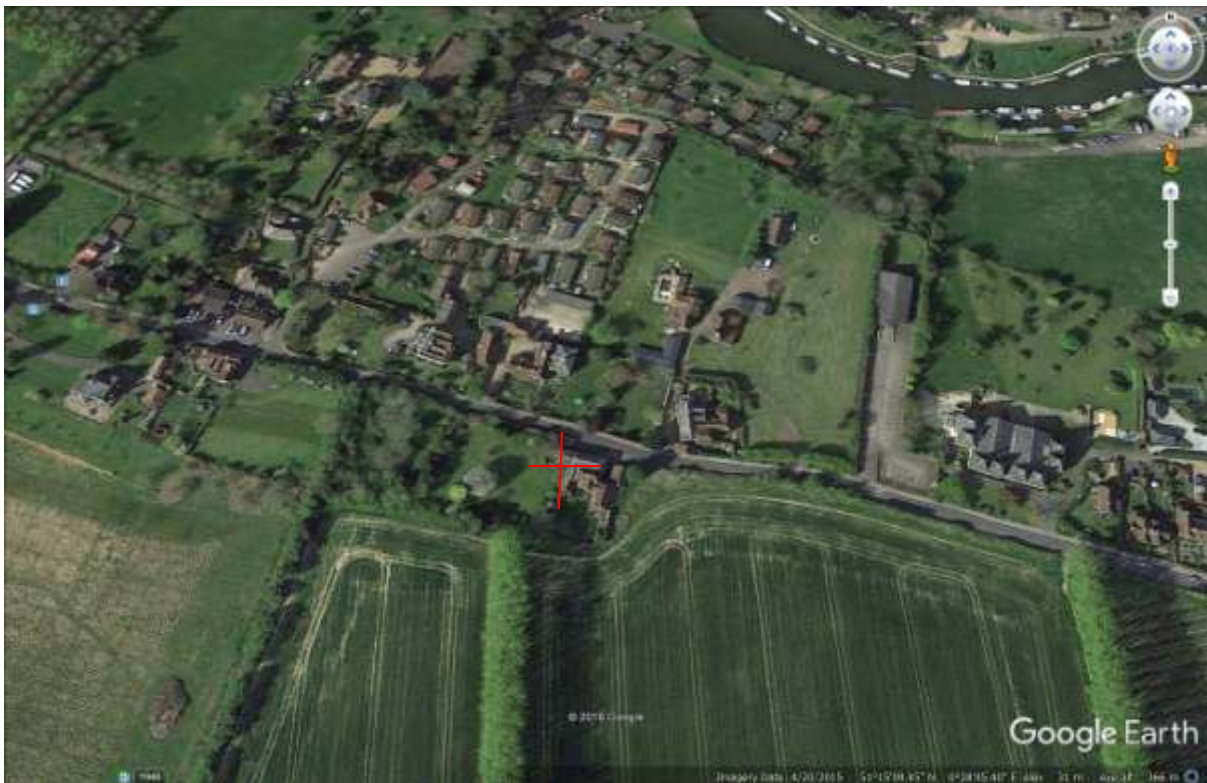
Plate 1. Aerial view of site (red target) showing the site prior to development.

(Google Earth 20/4/2015: Eye altitude 366m).