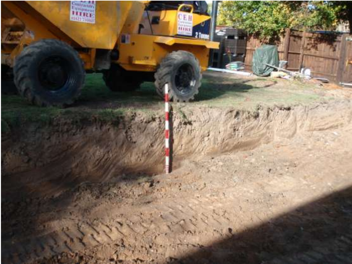
Plates 5, 6. View of the ground reduction